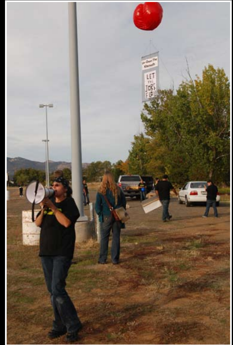
(top left) Pro dam removal advocates rally in Yreka.