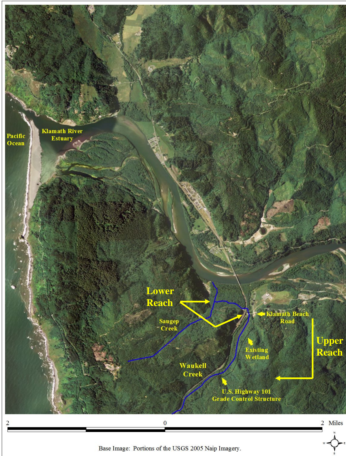
Figure 1. Map depicting restoration reaches in Waukell Creek, Lower Klamath River.