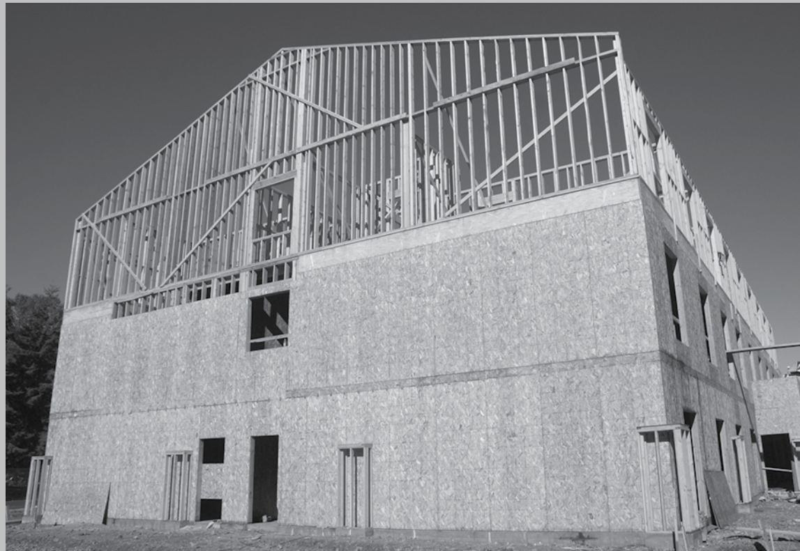
The third floor of the hotel gives rise.

The opening of the new resort in May means more jobs for Tribal members. These new jobs will include a range of entry level and supervisory positions. Since the new facility is a highly regulated business, employees will need a GED and must pass a high security gaming background check, which includes a credit and criminal history. Any member who needs assistance in completing their GED to prepare for these