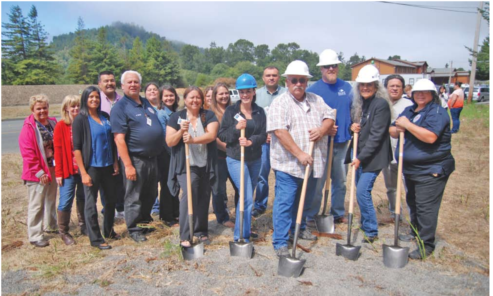
The Yurok Tribe recently broke ground on the new Yurok Justice Center. The new Justice Center is being built next to the main tribal office in Klamath.