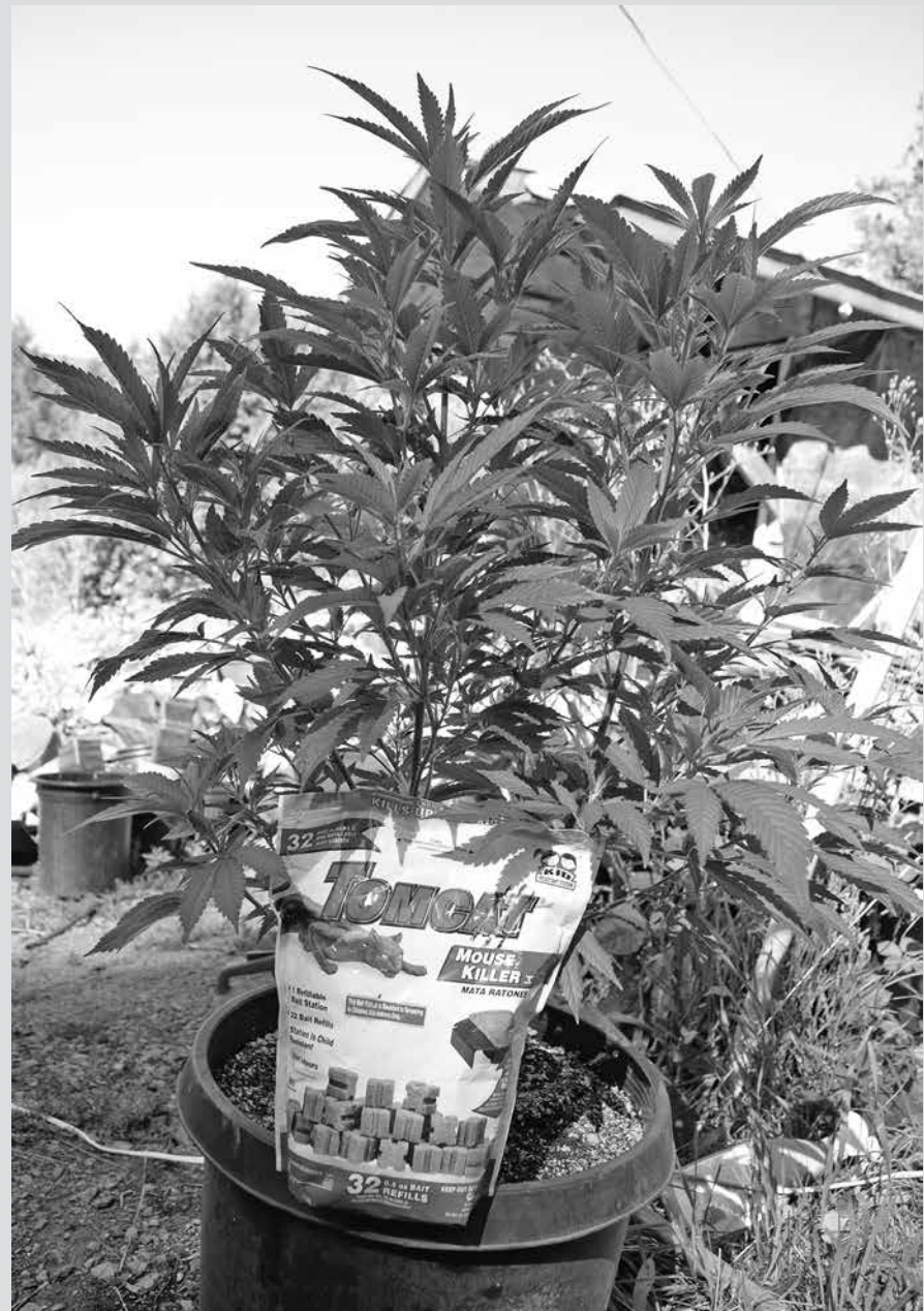
Researchers determined that rodenticides, like this one, are responsible for killing wildlife.

Operation Yurok began in 2013 after residents living on the upper reservation nearly ran out of drinking water as a result of illegal water diversions from creeks that feed the Tribe's and