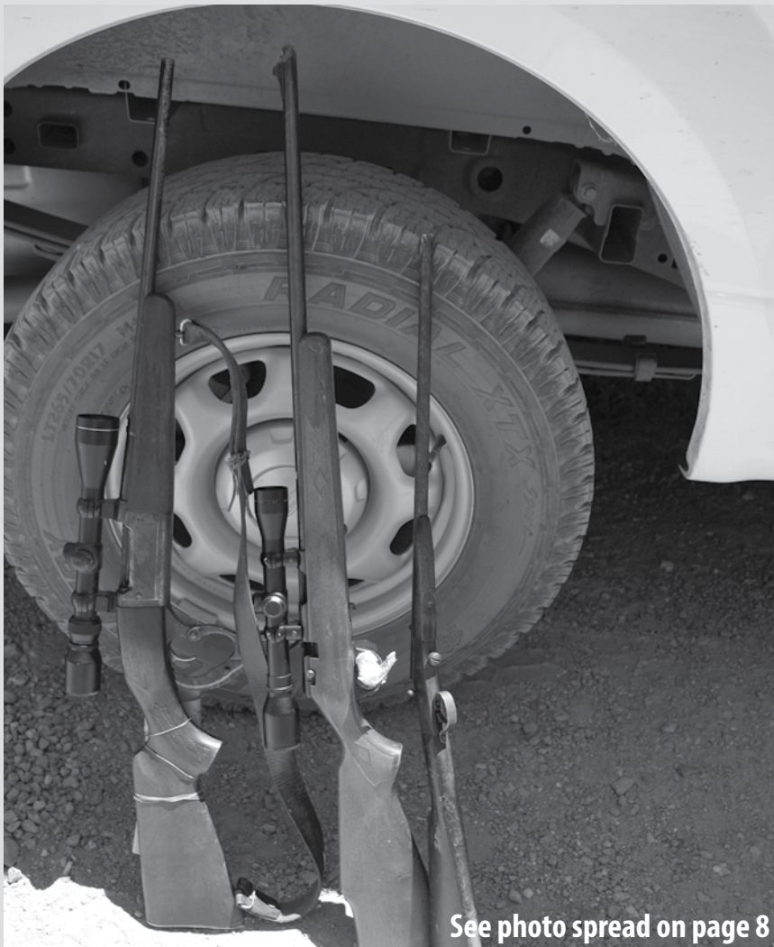
See photo spread on page 8

This year, the Tribe will for the first time be taking legal action against the growers for violations of the Cultural Resource Protection Ordinance, which is place to protect Tribal cultural properties. The clear cuts, water pollution and grading, associated with the grow sites, have the potential to harm cultural resources. ❖