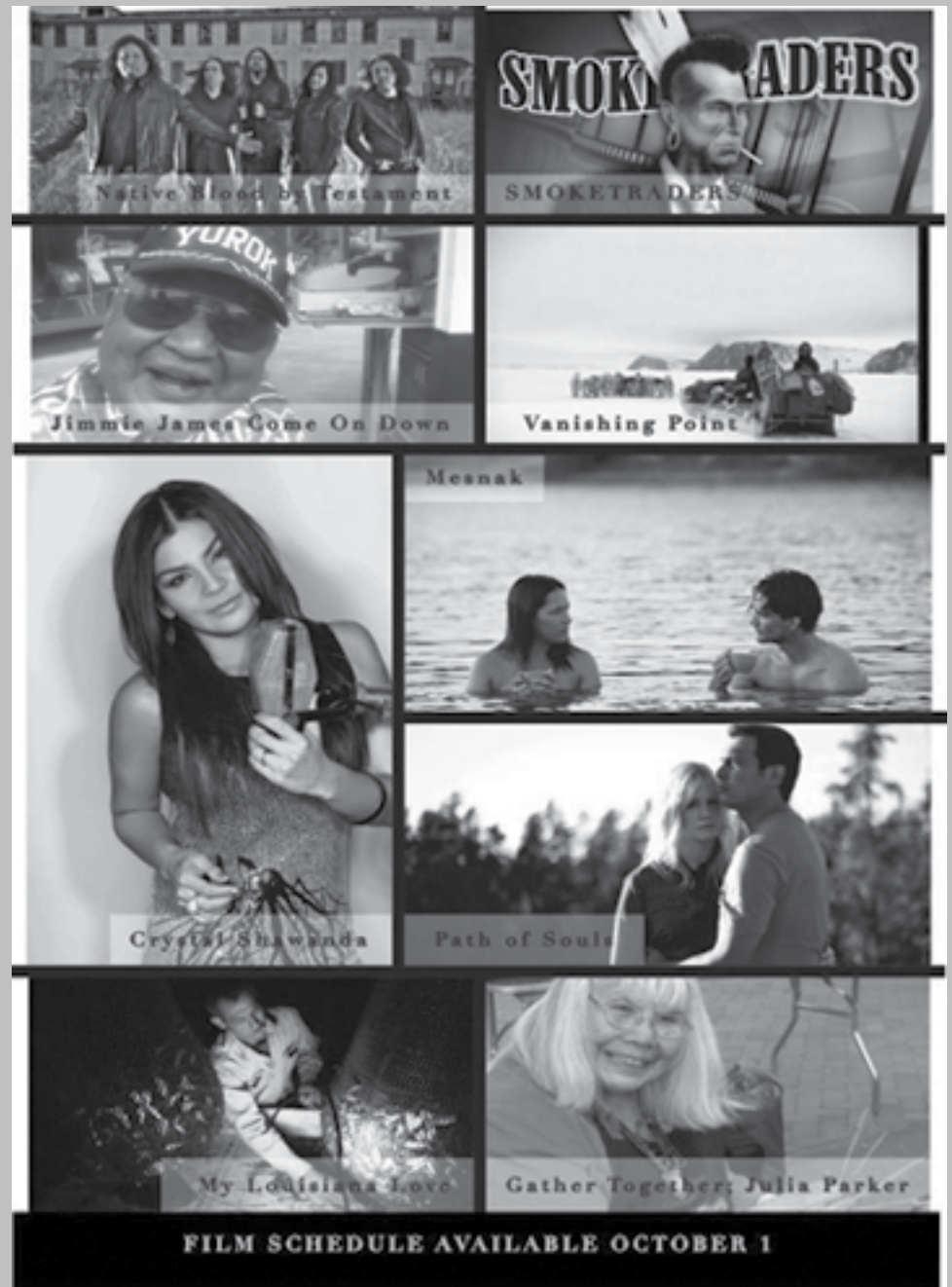
Matzgar's film was highlighted at the 2012 American Indian Film Festival in San Francisco.

Most people who ask me about the film have never even heard of the Yurok Tribe. I hope people will see that beyond the facade of Wal-Marts and Starbucks, that Native American Tribes