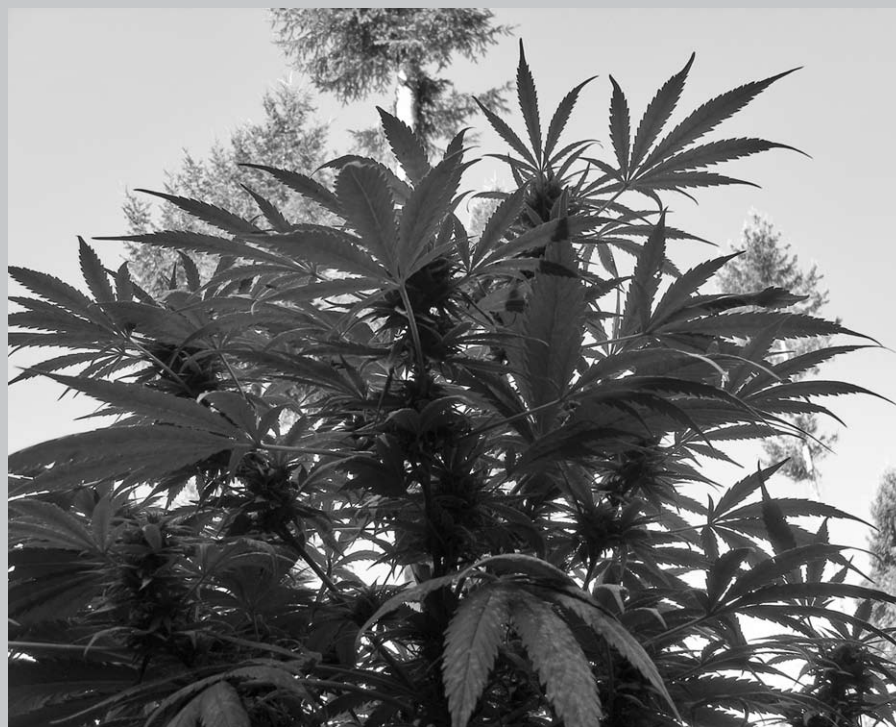
Marijuana is illegal within the Yurok Reservation boundaries.

In addition, the Office of the Tribal Attorney warns that Proposition 215 "prescriptions" are actually medical "recommendations." Licensed physicians may not prescribe marijuana because the Federal Food and Drug Administration is the agency that regulates prescription drugs. [U.S. DOJ, DEA, Practitioner's Manual, Section V "Valid Prescription"] Physicians may only issue a recommendation under California law. "A doctor who actually prescribes or dispenses marijuana violates federal law." [Conant v. Walters (2002) 309 F.3d 629, 632] The California compassionate use act is pre-empted by federal law. [Gonzales v. Raich (2005) 545 U.S. 1]