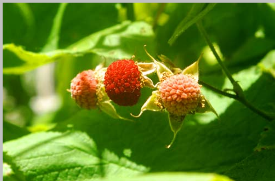
Thimbleberries may not be the most abundant fruit, but the raspberry relative is worth the effort.

DATE: Thursday, August 21, 2014; 10AM PLACE: Yurok Tribe Council Chambers 190 Klamath Boulevard, Klamath, CA