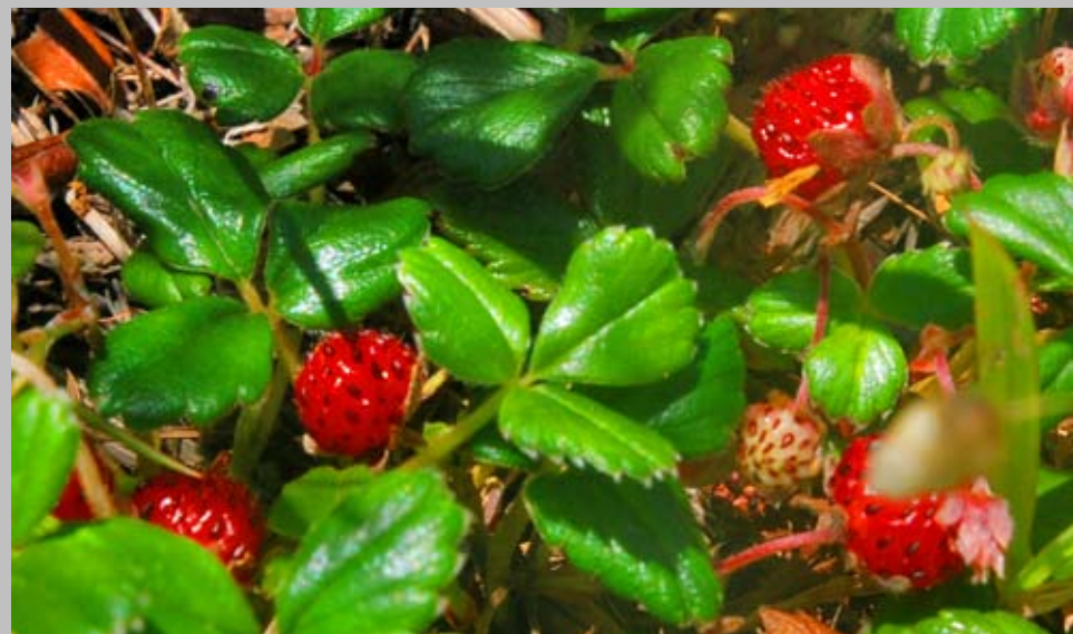
Native strawberries taste much better than those purchased at the market.