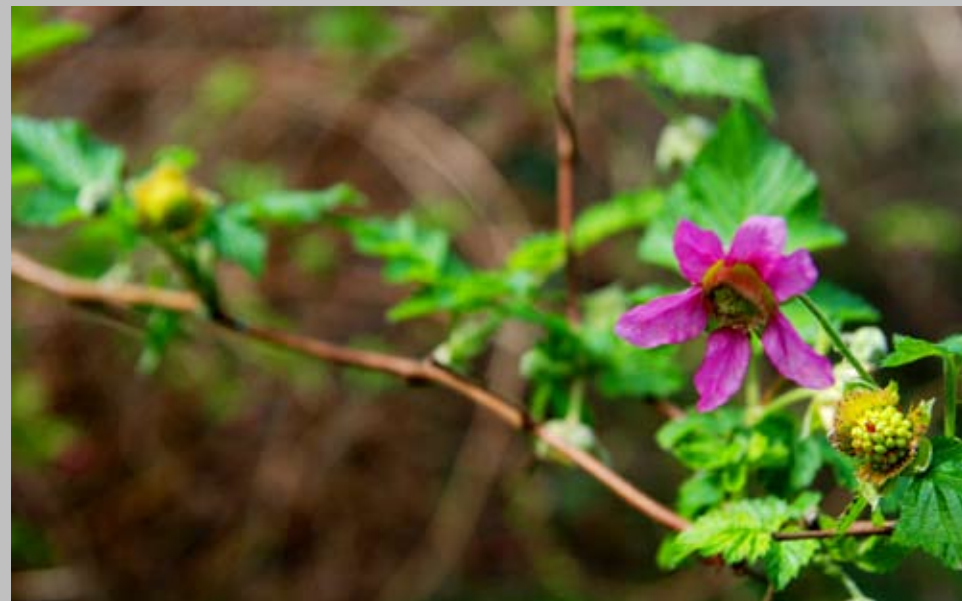
Salmon Berries fruit abundantly in the late spring.

"Whatever you do, don't muck with the soil," Lara concluded. ❄