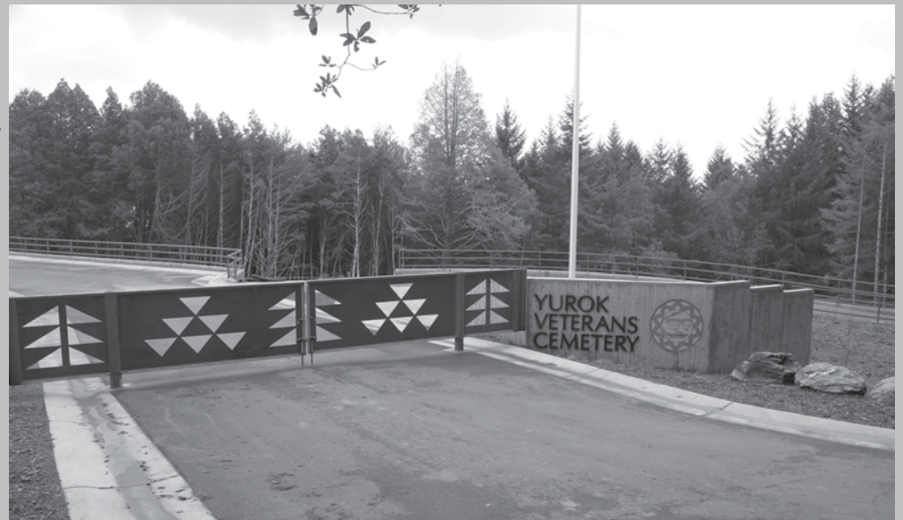
The elegant facility is surrounded by a tranquil forest of tanoak and Douglas fir.

During the week and a half long effort, the California National Guard’s Counterdrug Taskforce and Humboldt County Drug Task Force, along with Yurok Public Safety and many other county and federal law enforcement officers removed 15,000 illegal pot plants from the Yurok Reservation and surrounding area. Many of the growers were unlawfully tapping into creeks that feed the tribal and private water systems, causing major