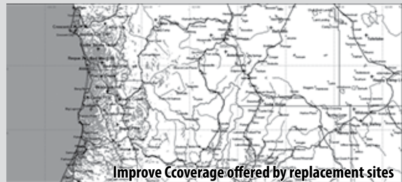
Improve Coverage offered by replacement sites

Wilderness Act, Tribes gained a new tool for protecting religious freedom after being defeated and denied freedom of religion by the highest court in the United States.