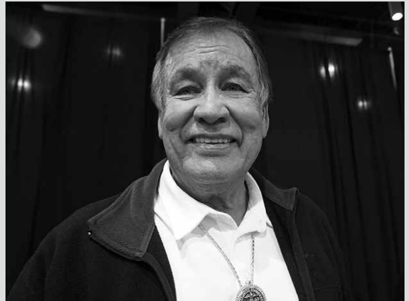
Billy Mills is from the Lakota Oglala Sioux Tribe, which is located in South Dakota. Mills won the olympic gold medal (10,000 meter run) in the 1964 Tokyo Olympics.

The blizzard continued to rage across North Dakota that night and all the next day. Travel halted completely. The Standing Rock Sioux's Prairie Knights Casino & Resort was booked solid even before the weather turned. And yet, the staff remained even-keeled and gracious as the building became a refuge for water protectors who got stranded