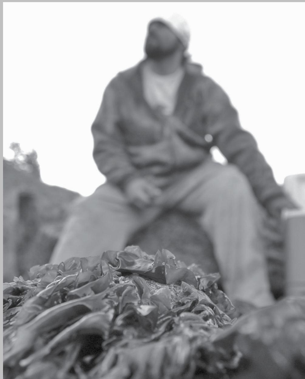
Key'-ween we che-qel' (seaweed) is one of the healthiest foods on the planet.

“Overall, the majority of commonly consumed traditional, aquatic foods are very safe to eat and including them in our daily food can be part of a healthy diet and may help improve overall health,” concluded Dr. Sloan.