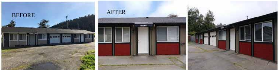
The final project is located in the Klamath Glen.