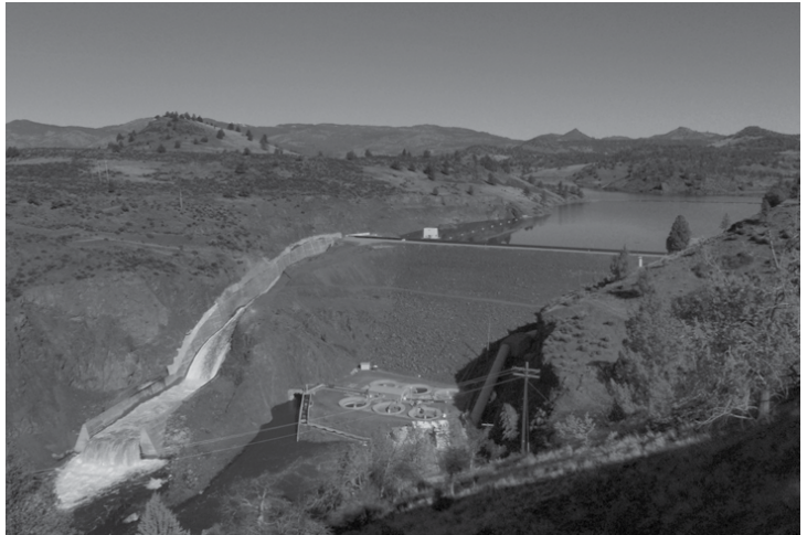
Iron Gate is the first of four dams slated for decommissioning in 2021.