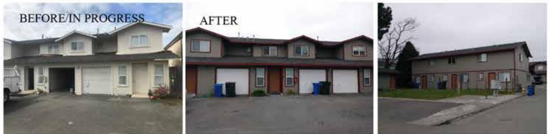
Above is the Chance Lane Apartments. Below is the Orick Multi-plexes.

The Yurok Indian Housing Authority has been working to prioritize much needed maintenance on our units. In the last few months we have painted the Chance Lane Apartments, Orick multi-plexes, and an individual YIHA home in the Klamath Glen. The work was completed by All Star Painting. We will continue to work towards ensuring our tribal members are proud of the places they call home.