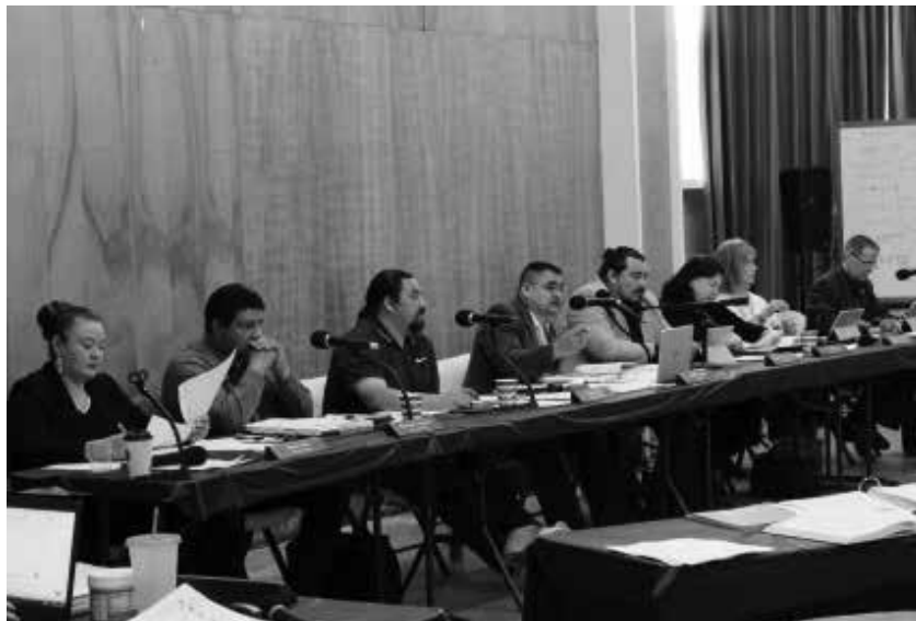
The Yurok Tribal Council passed the Hemp Ordinance at its meeting on May 9, 2019.

Although the plant is a cannabis sativa relative, consuming hemp or products made from it, even in large quantities, will not result in intoxication. That is why it was removed from the Schedule 1 controlled substances list. Currently, milk alternatives, protein powder and bread made from hemp seeds, most of which are grown outside of the US, are common features on mainstream grocery stores shelves. However, companies will soon be able to source hemp from tribes and all 50 states with the