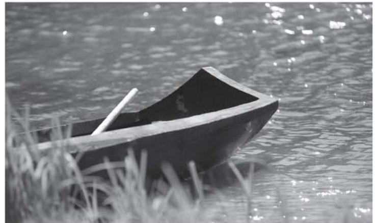
The Yurok Tribe and the YEDC are developing a Redwood Canoe Adventure Tour business in Klamath.