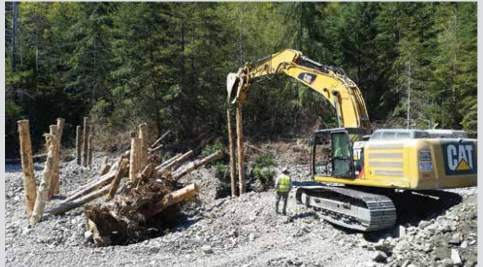
Yurok Tribal member Aldaron McCovey and Rocco Fiori build fish habitat on the Lower Klamath.

The primary objective for all three projects is to restore riparian habitats, one of the most biologically productive places in the watershed. These special zones are fundamental to the success of native fish populations, as well as that of many terrestrial and aquatic animals. The strategic reintroduction of several types of wood structures is an essential part of rebuilding these unique ecosystems. These biodiversity building components mimic the natural features found in pristine riparian areas, and are nearly identical to those that supported the large fish runs that sustained