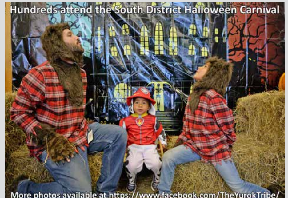
Hundreds attend the South District Halloween Carnival