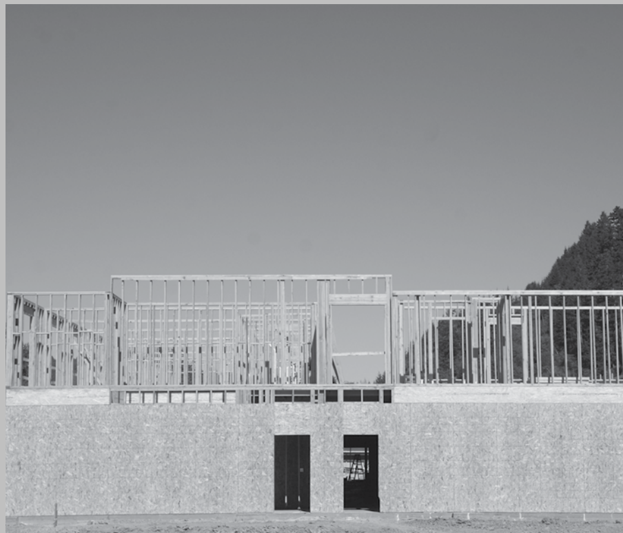
The second floor goes up on the Yurok Tribe's first hotel and casino.

9. 2013 Commercial Fishery: Fishermen will be paid $5.00 per pound this year. Please remember your cultural values while fishing this year: no fighting on the River, respect the River and each other while fishing. The estuary is a first come for fishing spots – it is not safe, lawful, or proper to come late and set in front of someone if you are less than 50 feet in front of them. This is a time for everyone to give thanks to the creator for the opportunity to provide for your family. Be safe and take time to enjoy your time on the River.