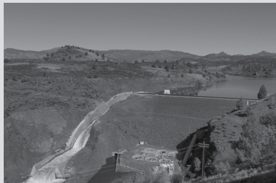
Irongate Dam is the first of four large dams on the Klamath River.

“It’s a shame that congress would not move the larger Klamath legislative package. Dam removal is a huge leap forward, but we still need to resolve water disputes between river communities and farm communities,” adds Saxon.