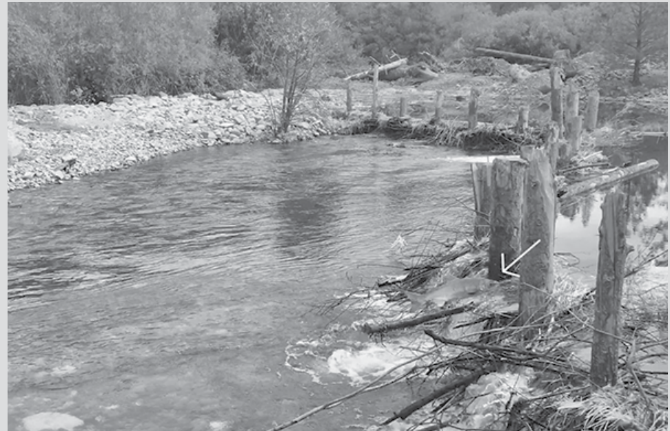
An adult salmon jumps over this analog beaver dam within days of its completion.

On a recent morning, in the three-day old wetland at Bucktail, songbirds stood on logs — put in place by Roger Boulby — protruding from the water, while migrating Canadian geese honked as they passed overhead. A doe and her two fawns sipped from the edge of the cool, clear water. From the deer's vantage, those adult salmon could be seen spawning in the current. It was easy to imagine, great blue herons, bald eagles and many other animals making a future appearance at this biological oasis.